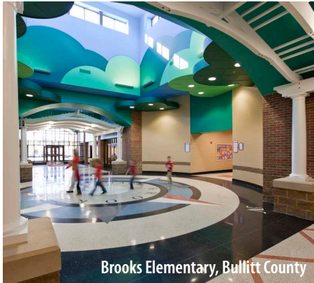
Brooks Elementary, Bullitt County