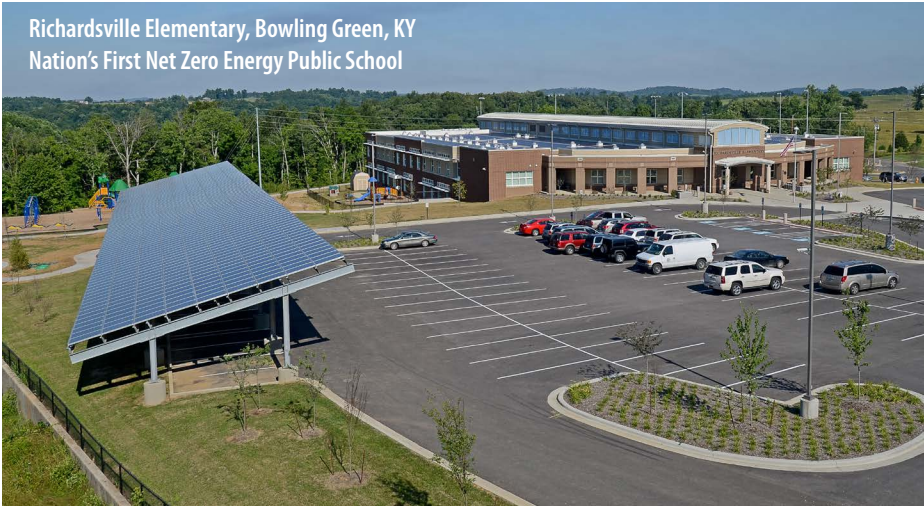
Richardsville Elementary, Bowling Green, KY Nation's First Net Zero Energy Public School