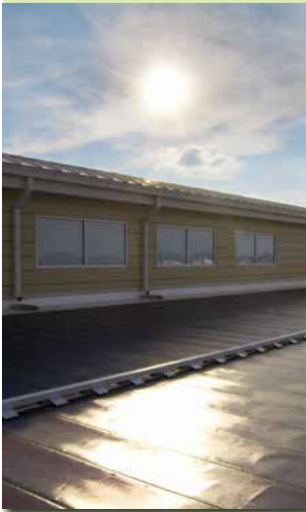
Photovoltaic panels at work on the roof of the Richardsville School.

The ICF schools here do not cost any more to build than traditional schools, about $225 per square foot. This is attainable technology with funds available for all people and all communities. The Kentucky Board of Education now requires new schools to be constructed using NUDURA's Insulated Concrete Forms, unless the designers can provide a reason why they choose not to use it. The biggest bonus might be these schools also are disaster resilient. The insulated concrete forms can withstand tornadoes well in excess of the minimum design criteria required in Kentucky.