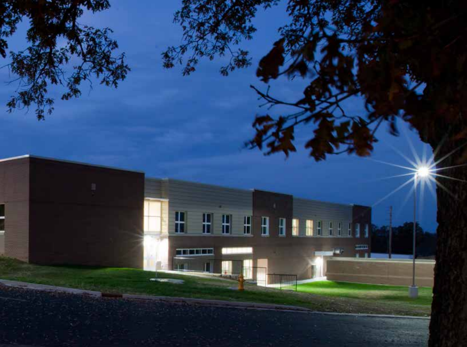
NUDURA Radius Forms are custom cut at Nudura's plant facility to meet the design specifications, then preassembled for easier and faster installation.