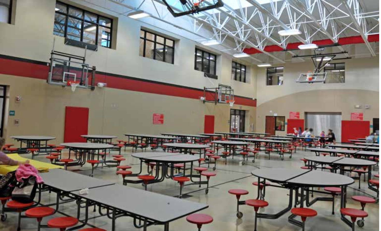
Energy demand is reduced by the daylighting from clerestory windows in the dual-purpose gymnasium and cafeteria. Courtesy Sherman Carter Barnhart Architects.

to using Energy Star-rated kitchen equipment, combi-ovens were installed in lieu of fryers and skillets. The combi-ovens use steam instead of grease, also eliminating the Class 1 hood requirements necessary to capture grease vapors.