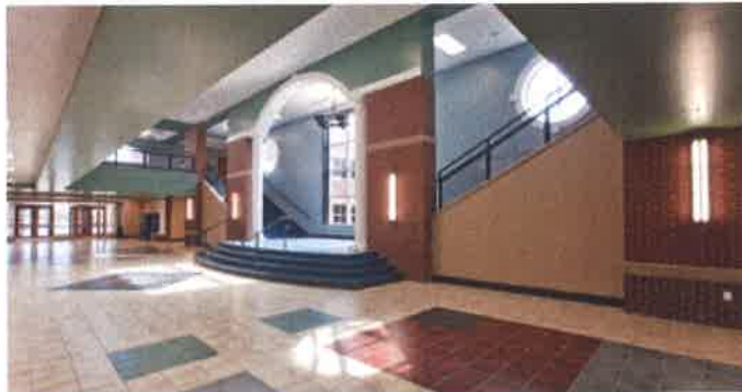
The 'student commons', flanked by the grand stair, allows students to congregate in safe, easy to supervise areas between classes.