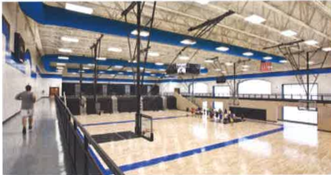
The walls of the gymnasium are 12" ICF, which provided excellent acoustic separation from the adjacent instructional spaces.