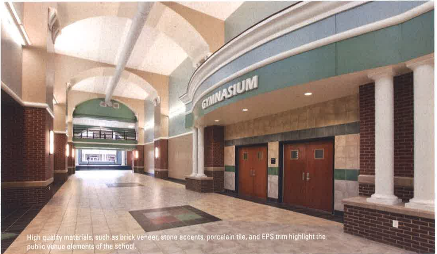
High quality materials, such as brick veneer, stone accents, porcelain tile, and EPS trim highlight the public venue elements of the school.