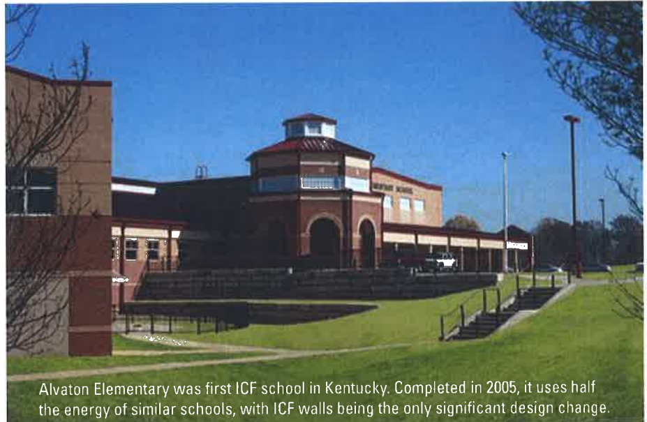
Alvaton Elementary was first ICF school in Kentucky. Completed in 2005, it uses half the energy of similar schools, with ICF walls being the only significant design change.

The Warren County Board of Education and Sherman Carter Barnhart Architects had significant experience together with ICF construction, beginning with the design of Alvaton Elementary School, the first ICF school facility in Kentucky. In 2005, the average energy consumption for a similar school was 76 EUI. The year it opened, Alvaton’s energy consumption was cut in half, operating at only 36 EUI, with ICF construction being the only significant design change.