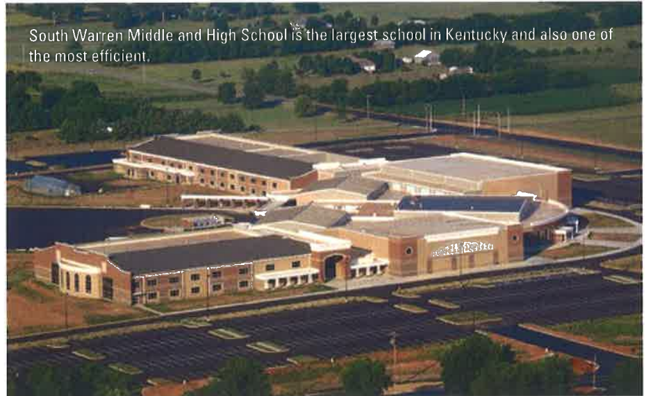
South Warren Middle and High School is the largest school in Kentucky and also one of the most efficient.

choosing a material with a high R-value, though, thermal mass plays an incredibly important role in reducing energy consumption. While the high R-value of ICF's resist internal temperature change, the high mass of the concrete wall system absorbs energy and stores it. This is critical in any climate where daytime temperatures